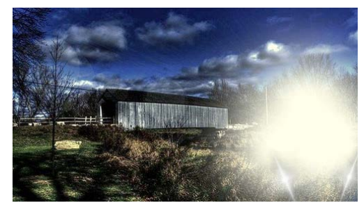
The covered bridge was about 10 kilometers from the Reed's diner. Cars are not allowed to drive over the covered bridge anymore.

The family was driving home after enjoying a meal at their diner.