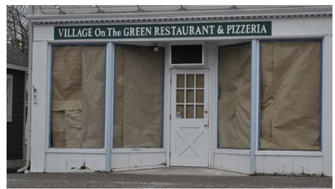
The family diner "The Village on the Green

"What I saw changed my life. I used to be an altar boy... I don't have my faith anymore. It's gone. You start to think why are we here, and what all this means."