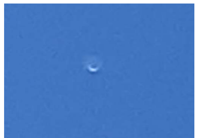
Translucent Object August 18,10 a.m. Cleveland area (Similar Object reported in Cincinnati)